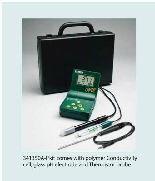
341350A-P kit comes with polymer Conductivity cell, glass pH electrode and Thermistor probe