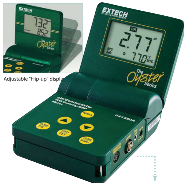
Adjustable “Flip-up” display