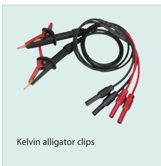
Kelvin alligator clips