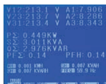
Backlit LCD displays numerical values