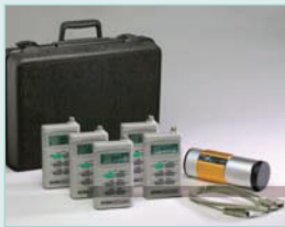
407355-KIT-5 Dosimeter Kit

Includes PC Windows® compatible software to maintain records and statistically analyze acquired data