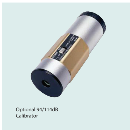
Optional 94/114dB Calibrator