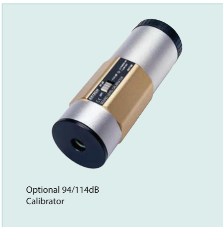
Optional 94/114dB Calibrator