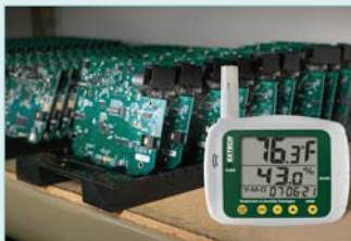
Displays and logs the Humidity and Temperature levels in Production areas