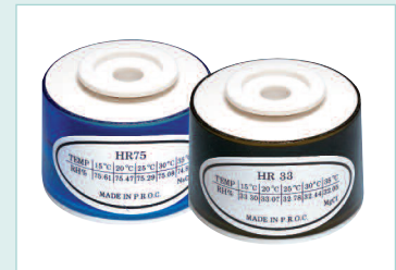
RH300-CAL Optional calibration salt bottles