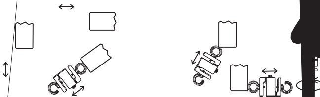
Figure 1 – Correct and Incorrect Angles of Measurement

Note: The sensing head with adapter must be in line with the object being measured. Avoid rotating the sensing head. Refer to the Figure 1.