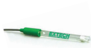
60120B - Mini size