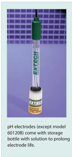
pH electrodes (except model 60120B) come with storage bottle with solution to prolong electrode life.