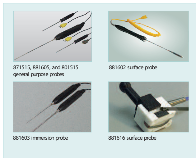
871515, 881605, and 801515 general purpose probes