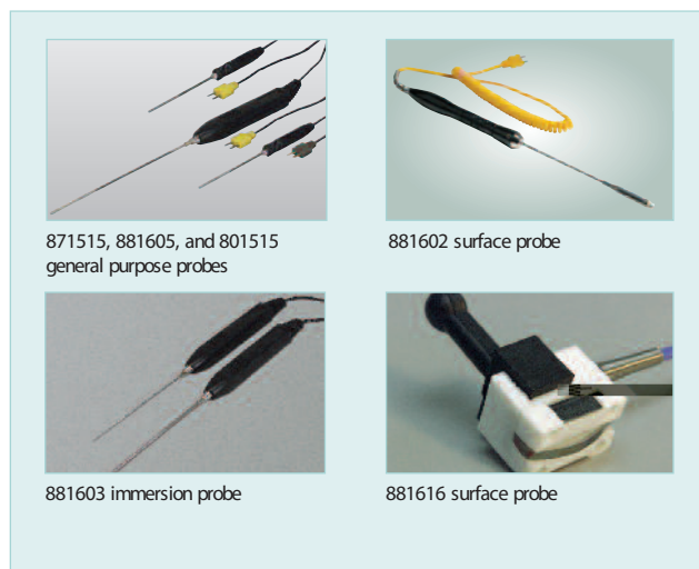
871515, 881605, and 801515 general purpose probes