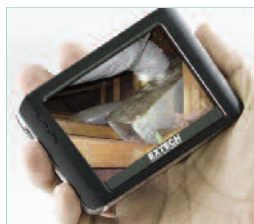
Detachable wireless 3.5" color TFT LCD display can be viewed from a remote location up to 32ft (10m) from the measurement point.