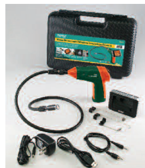
Complete with 4 AA batteries, rechargeable display battery, microSD memory card with SD adaptor, USB cable, extension tools (mirror, hook, magnet), video interconnect cable, AC adaptor (100-240V, 50/60Hz), magnetic base stand, and hard case