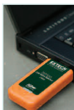
BRD10 - Optional Wireless USB Video Receiver allows user to stream live video to a PC and also can be remotely viewed via VOIP connection