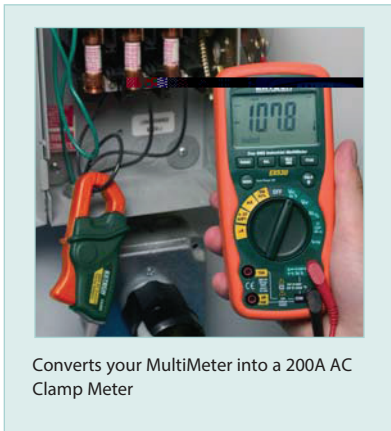
Converts your MultiMeter into a 200A AC Clamp Meter