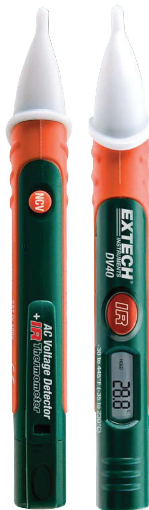
Non-Contact AC Voltage Detector