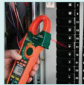
Built-in IR Thermometer for quick and safe non-contact temperature measurements. Find hot spots fast!