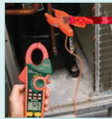
Dual Type K Inputs for taking differential temperature readings needed for superheat measurement