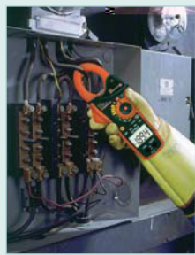
CAT IV -600V safety rating for added protection and the True RMS feature gives you accurate readings of non-sinusoidal waveforms.