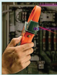
Built-in IR Thermometer with laser pointer is an excellent troubleshooter for locating hot spots and overheating motors.