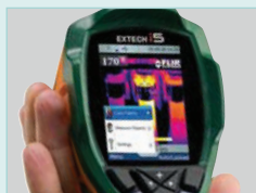
Large 2.8" color LCD