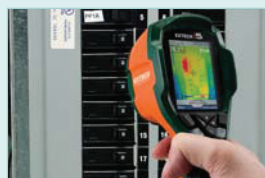
Detect hidden problems fast