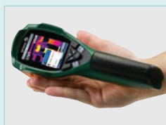
Pocket sized and extremely lightweight—only 12 ounces