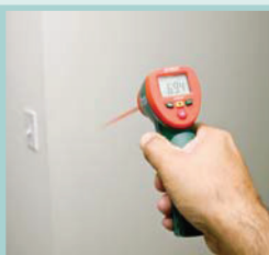
Check building for insufficient insulation