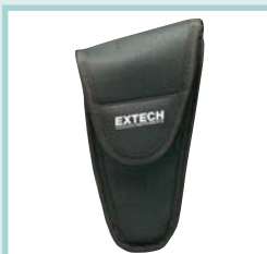
Convenient carrying case included