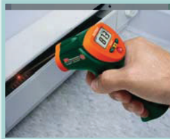
Test for temperature in heating systems