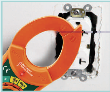
Built-in non-contact Voltage detector with LED alert