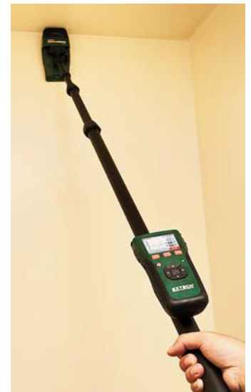
Wireless sensor affixes to telescoping handle