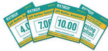
PH103 includes 6 pouches each of pH 4, pH 7, and pH 10 Buffers plus 2 Rinse solutions