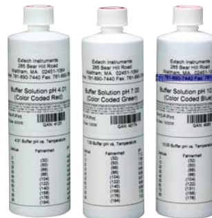
Pint size pH buffers for pH 4, 7, and 10 available (PH4-P, PH7-P, PH10-P)