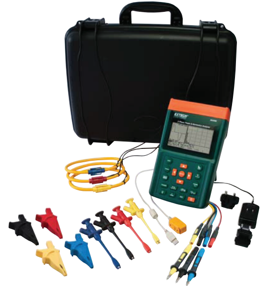
Includes (3) flexible current clamps, (4) voltage leads with alligator clips and retractable plunger clips, 8 AA batteries, universal AC adaptor, software, USB interface cable, and case