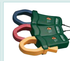
Model PQ3120 1000A Current Clamp Probes with 2.2" (55mm) jaw opening