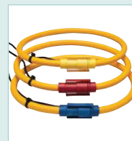
Model PQ3220(3000A) Model PQ3210(1200A) 1200A (12"/304mm) or 3000A (24"/609mm) Flexible Current Clamp Probes for wrapping around busbars

Choose the best clamp probes to fit your application needs ranging from 100A to 3000A and flexible vs traditional jaw type.