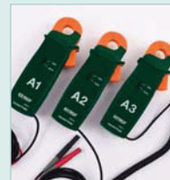
Model PQ34-2 200A Current Clamp Probes with 0.8" (19mm) jaw opening

Choose the best clamp probes to fit your application needs ranging from 200A to 3000A and flexible vs traditional jaw type.