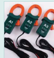
Model PQ34-12 1200A Current Clamp Probes with 2" (50mm) jaw opening