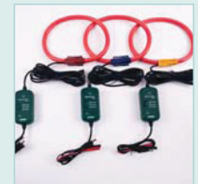
Model PQ34-30 3000A (24"/600mm) Flexible Current Clamp Probes for wrapping around busbars