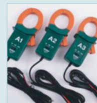
Model PQ34-12 1200A Current Clamp Probes with 2" (50mm) jaw size