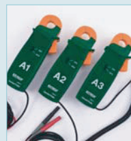
Model PQ34-2 200A Current Clamp Probes with 0.8" (19mm) jaw size

Choose the best clamp probes to fit your application needs ranging from 200A to 3000A and flexible vs traditional jaw type.