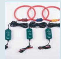
Model PQ34-30 3000A (24"/600mm) Flexible Current Clamp Probes for wrapping around busbars