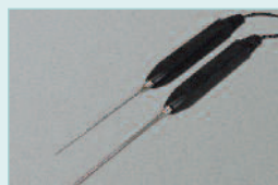
881603 immersion probe