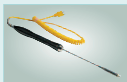
881602 surface probe