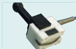
861616 surface probe