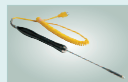
881602 surface probe