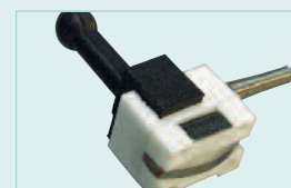
881616 surface probe