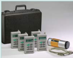
407355-KIT-5 Dosimeter Kit

Includes PC Windows® compatible software to maintain records and statistically analyze acquired data