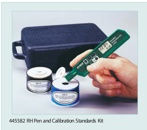
445582 RH Pen and Calibration Standards Kit