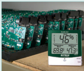
Indicates Humidity and Temperature levels in Production areas.