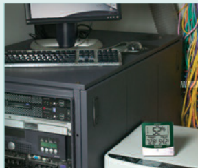
Alerts low Humidity levels in Computer rooms to help prevent electrostatic conditions.