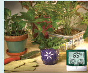
Checks the Humidity and Temperature levels for optimal plant growth in greenhouses.