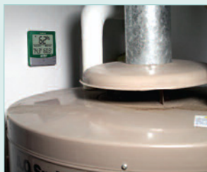
Monitoring Dew Point levels in a Basement for potential mold growth.