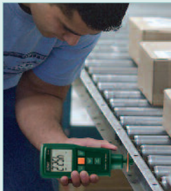
Contact Tachometer function measures the speed of rotating objects by placing the wheel tip onto the surface.