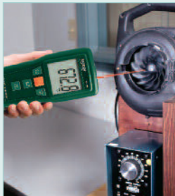
Photo Tachometer function measures the speed of rotating objects without contacting the surface by using a laser beam and reflective tape