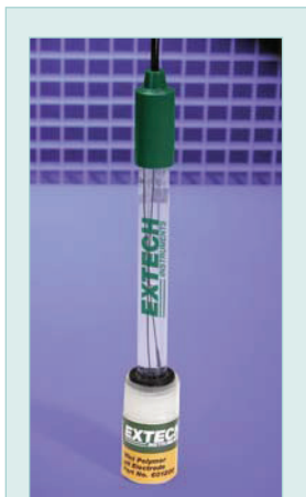
pH electrodes (except model 60120B) come with storage bottle with solution to prolong electrode life.