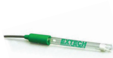
60120B - Mini size