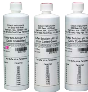
Pint size pH buffers for pH 4, 7, and 10 available (PH4-P, PH7-P, PH10-P)