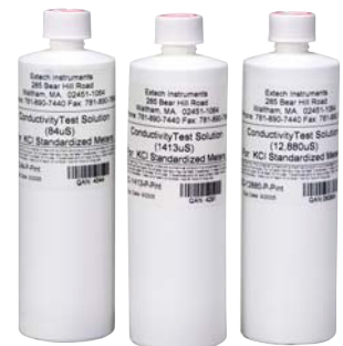
EC-84-P, EC-1413-P, and EC-12880-P pint size conductivity standards