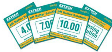
PH103 includes 6 pouches each of pH 4, pH 7, and pH 10 Buffers plus 2 Rinse solutions