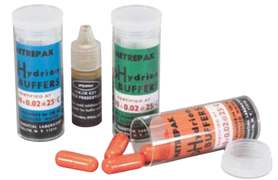
650470 pH 4, 7, and 10 buffer capsules with color key preservative