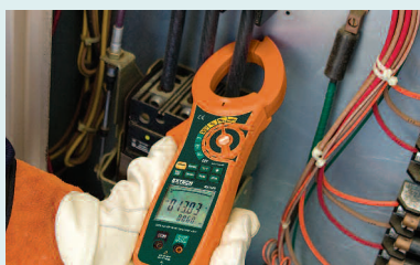
2.0" (52mm) jaw size for conductors up to 500MCM